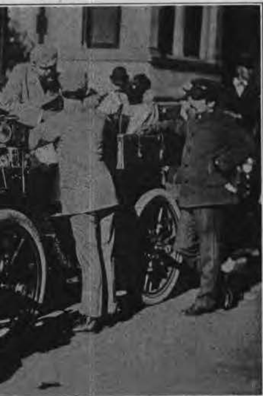
K IN HIS PANHARD.

The following is a list of a great number of arrivals and reports of their operators: C 56 (11:14) got a little too much lubricating oil into the cylinders; no hitch; B 22 (11:11) was tied up thirty minutes by a hot box; A 8 arrived shortly after 11; A 75 (11:22) blew out one inner tube, which was replaced; A 74 (11:31) punctured a tire and lost about fifteen minutes; B 34 (11:40) had no trouble; B 14 (11:03) reported a perfect run; C 23 (10:55) had not a single stop; C 24 (10:56) had no stop en route; B 26 (10:18), no stop; A 66 was apparently in good order; operator could not be found; C 30 (10:30) made one stop to exchange two ignition plugs; C 29 (10:30) had no stop; B 54 (11:15), no stop; C 77 (11:02), no stop; A 73 had one rear tire cut and some trouble with the battery connections coming loose; B 70 (10:02) had no stop; B 26 adjusted the steering mechanism at noon time; A 72 (11:15) had no trouble; B 85 (10:53) had no stop; B 68 (11:52), no trouble; A 47 (8:04) had to tighten and repack the stuffing box of the valve stem; on A 38 (10:56) one hind tire required a new inner tube; C 69 was a new carriage, said to have left the shop only the previous day; the engine heated a bit; A 63 (11:59) had a hot bearing in the engine; C 79 arrived about 11:17 and made no stop en route; in C 44 (11:59) the gasoline tank was injured on account of the carriage springs being too weak in front; B 43 (11:57) had no trouble; on C 18 (11:24) the