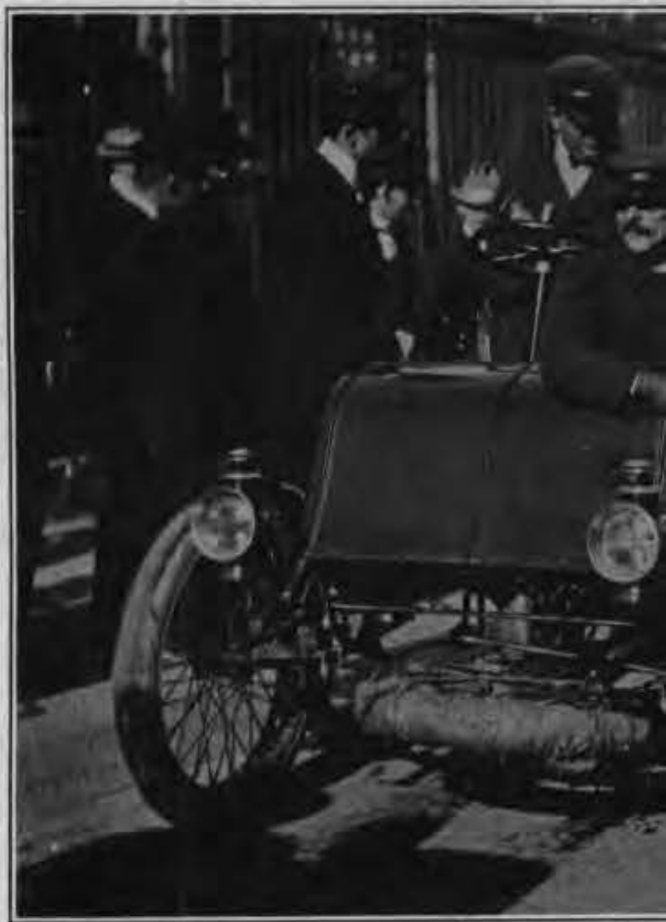
A. C. BOSTWICK AND B. B. McGR

The White steam carriages seemed to run very smoothly, and to be in lack of steam only on some of the heaviest hills, when the auxiliary hand pump was resorted to. The occupant of the second seat occasionally assisted in the operation by working the hand air pump to maintain the pressure on the fuel, this being done from the seat while the carriage was in motion, thus occasioning no delay. The