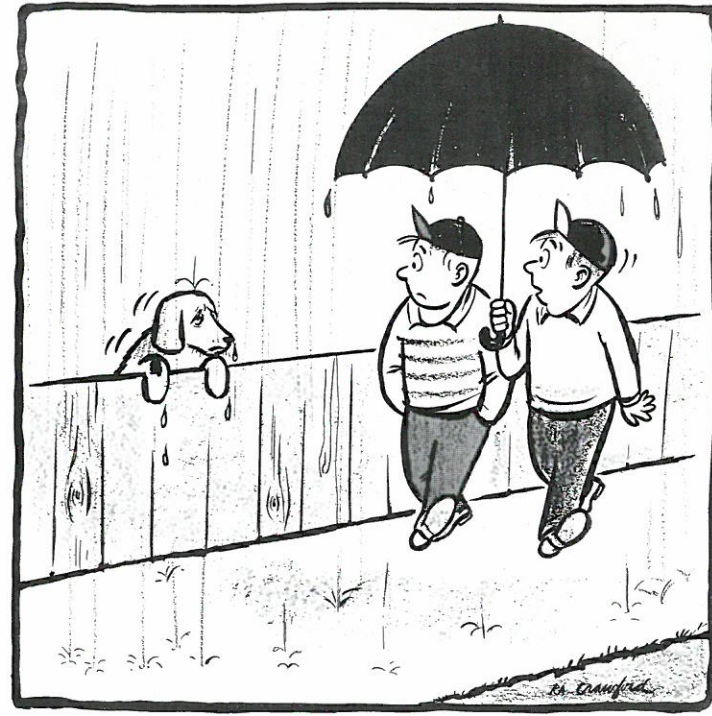
"Leaving a dog out in the rain is no way to give him a bath!"

These things on the ground may stick to the animal's paws