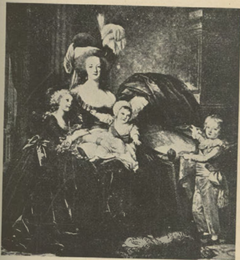
QUEEN MARIE ANTOINETTE AND FAMILY

Now, suddenly seized and imprisoned, hated by the mob, all their private rights taken from them, suffering daily abuse and insult, accused