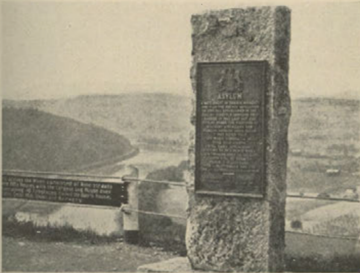
MARKER OVERLOOKING SITE On Sullivan Trail, Route 309.

She has included the last will and testament of Louis XVI, depicting his sentiments expressed while he was in the shadow of death and portraying, not the careless, frivolous, weak and stupid character usually attributed to him, but that of a man sobered by misfortune, humble, kindly and forgiving, remembering his friends with gratitude, commending them to the mercy of God and giving to his son, who, he hoped, would some day occupy his throne, sound advice for life both as a citizen and a King.