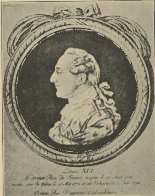
XXXX LOUIS, XVI, KING OF FRANCE

From Robert Morris an immense tract of land on the Susquehanna river was purchased.